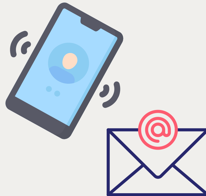
Contacting Elected Officials