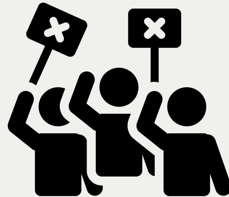
Days of Action